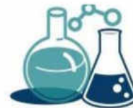
Bringing STEM into Active aging