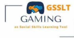
Gaming as social skills learning tool