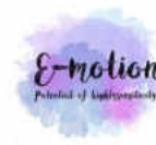
E-MOTION – potential of hypersensitivity